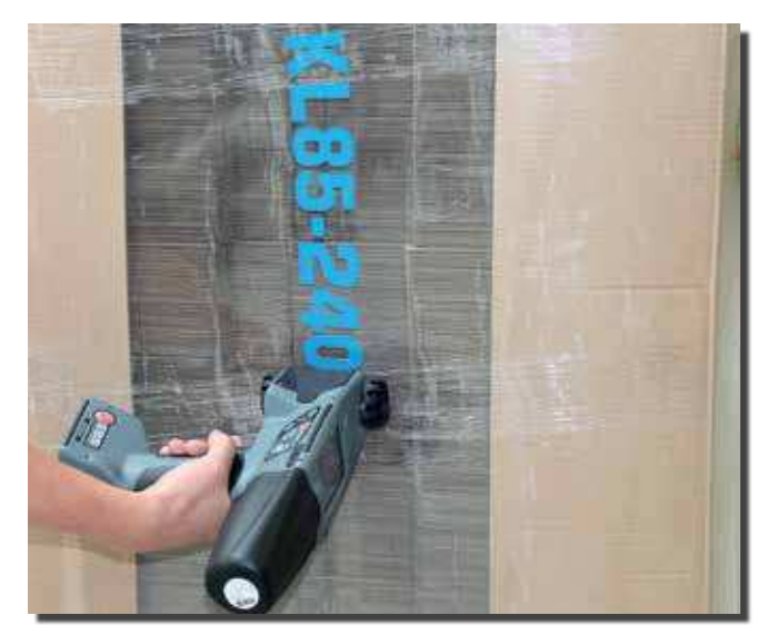
Prints on stretch wrap with pigmented ink