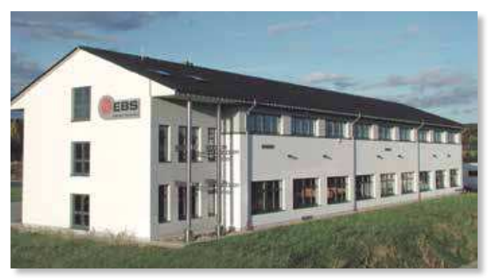
Head Office, Nümbrecht, Germany

We would be pleased to welcome you as our new customer!