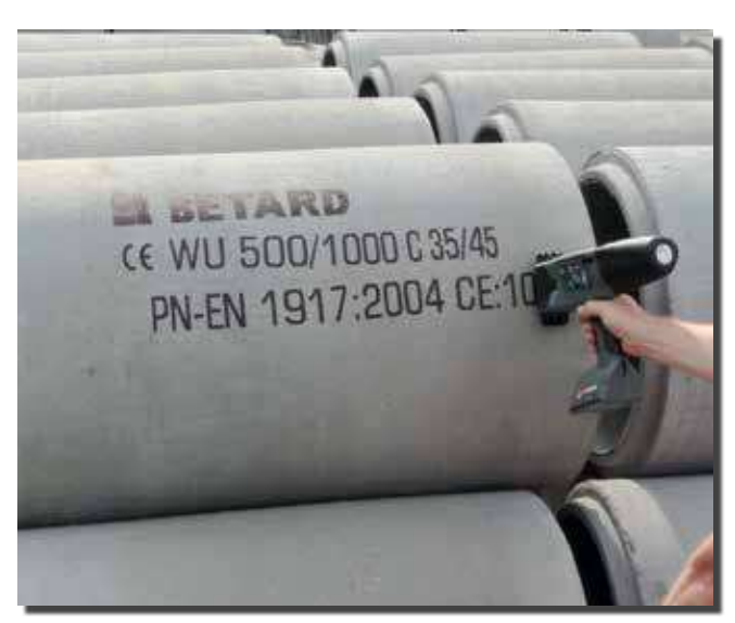
Prints on concrete with special UV-resistant black ink