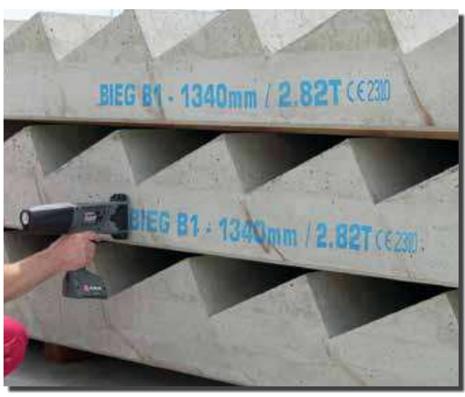
Prints on concrete with blue pigmented ink