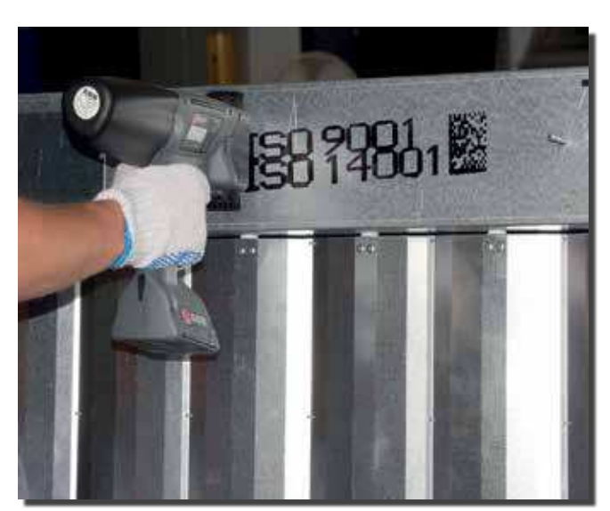
Prints on steel - 2D barcode - with black universal ink

EBS Ink Jet Systeme GmbH has been developing leading-edge industrial printing systems and consumables since 1977.